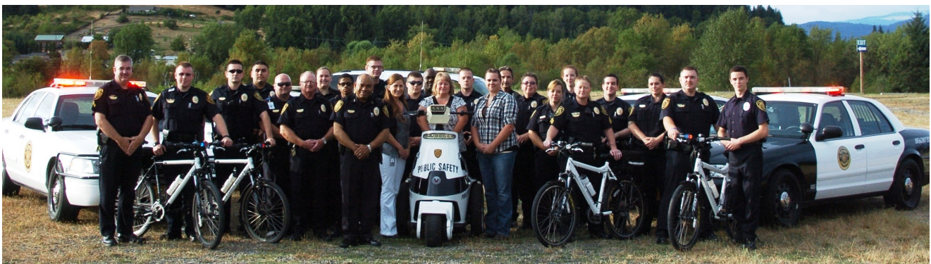
2014 Annual Department Photo

Talk to someone. Tell friends and family you're feeling overwhelmed, and let them know how they can help you. Talk to a physician or therapist for professional help.