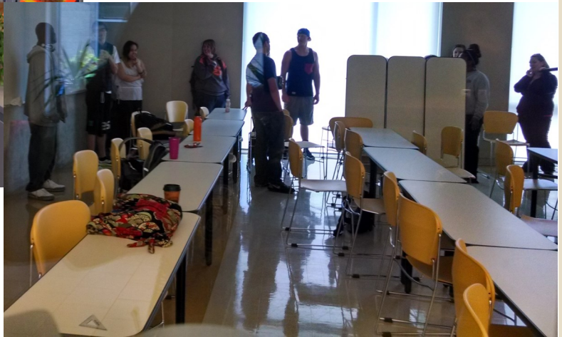
Students and staff barricade themselves in a classroom to ward off attack (Right)