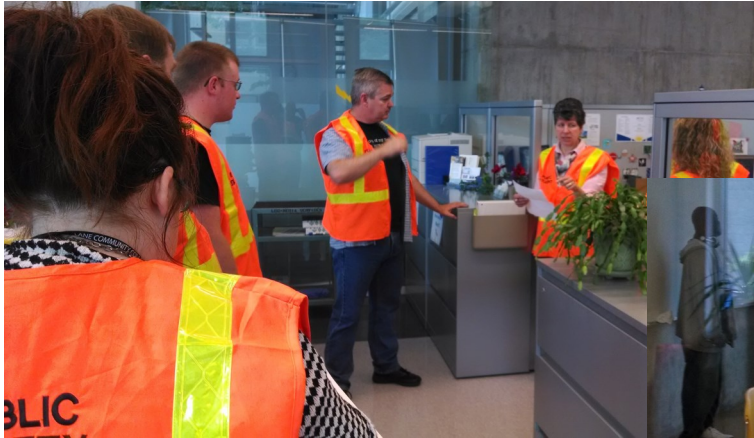
Officers and campus staff prepare to begin the drill (Top)