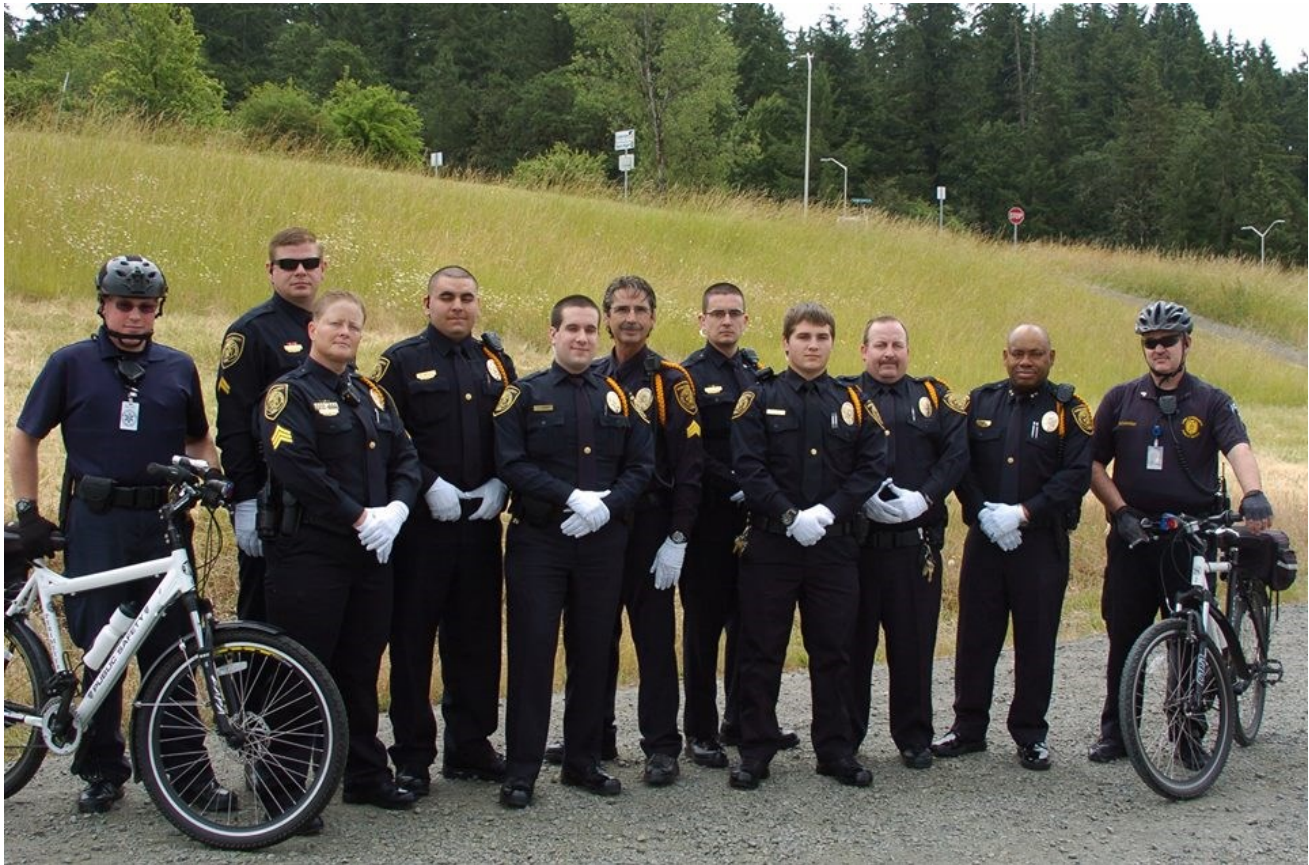
LCC 2014 Graduation Security Detail. Annually, Public Safety provides several officers to patrol and provide security, each year, for spring graduation celebration at the Fairgrounds.