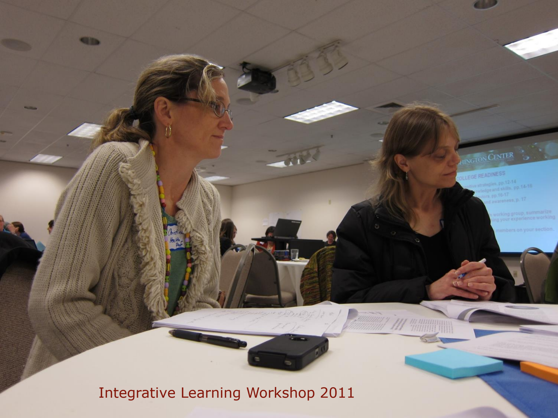
Integrative Learning Workshop 2011