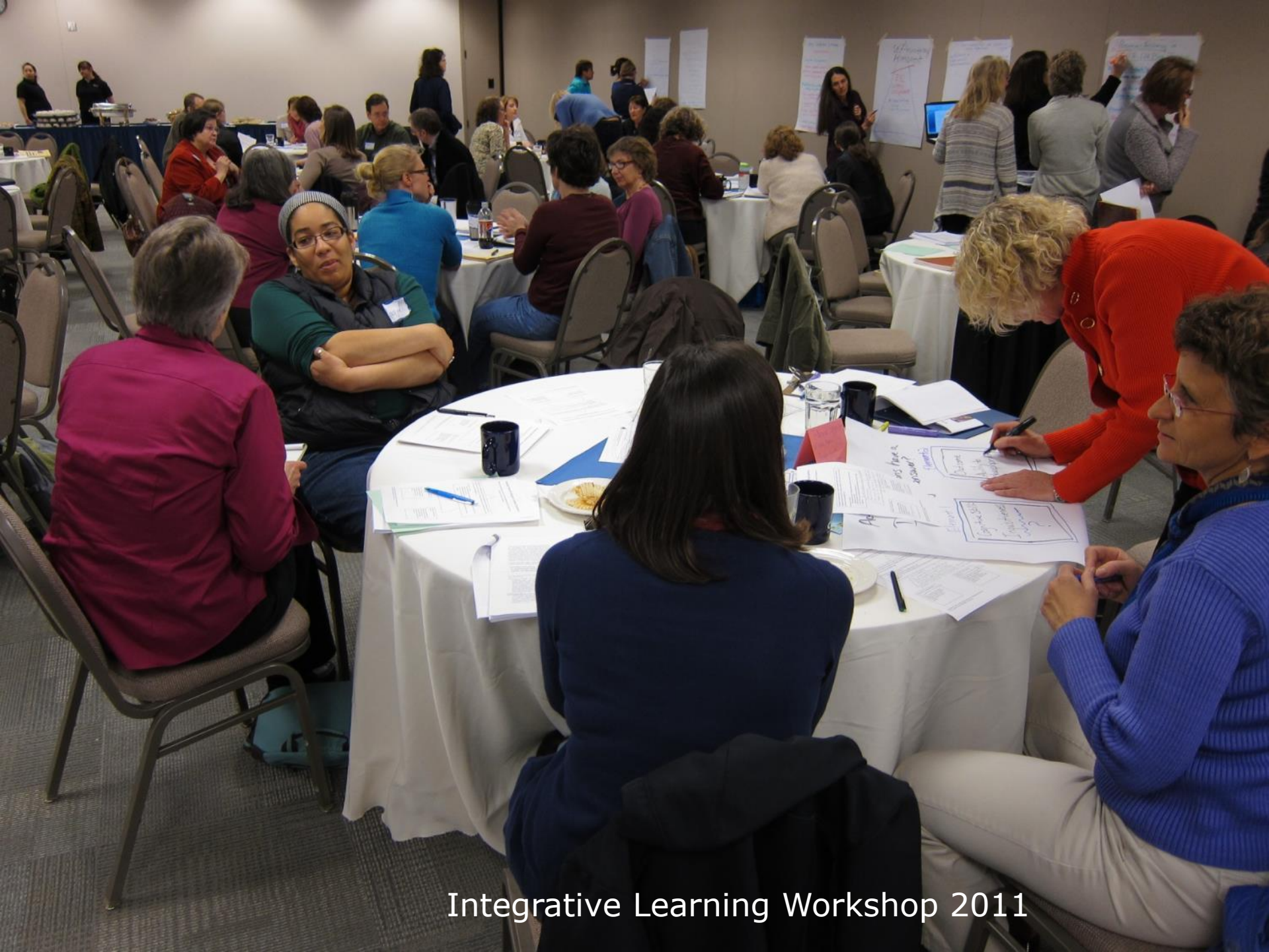
Integrative Learning Workshop 2011